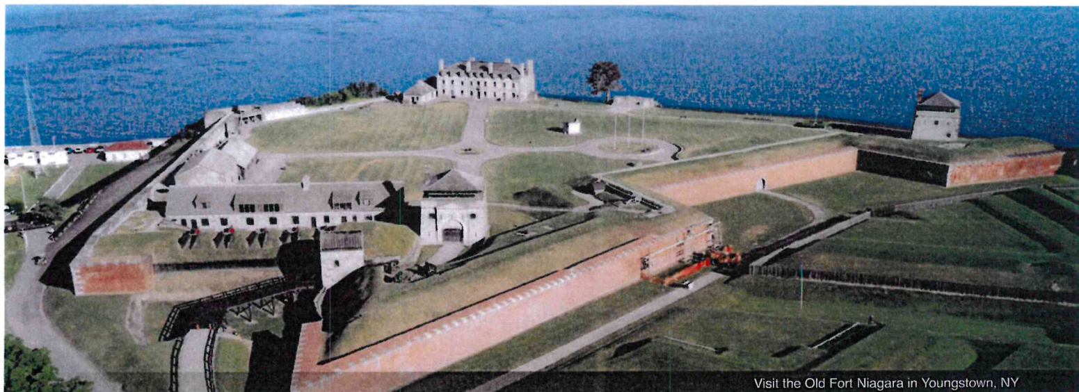
Visit the Old Fort Niagara in Youngstown, NY