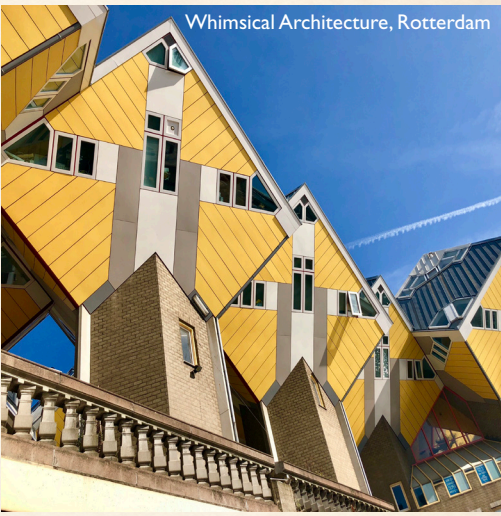
Whimsical Architecture, Rotterdam

CRUISE HOLLAND AND BELGIUM FEATURING YOUR MODERN "FLOATING HOTEL" THE M/S CRUCEVITA