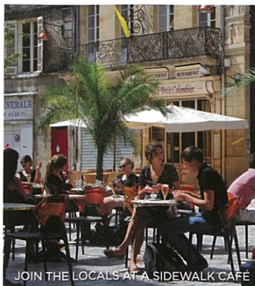
JOIN THE LOCALS AT A SIDEWALK CAFE