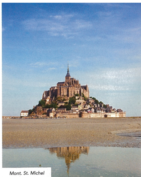
Mont. St. Michel

Above, the 230-foot long Bayeux Tapestry. Spend a night at St. Michel, World Heritage Site (bottom left) and explore Loire Valley's famous chateaus (below) and sample wines.