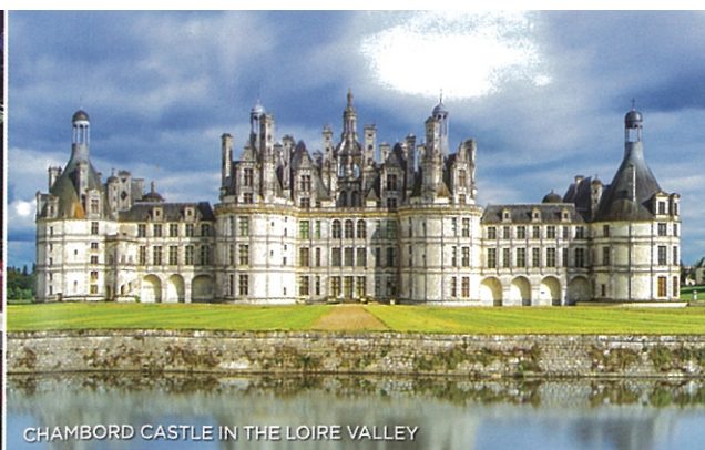
CHAMBORD CASTLE IN THE LOIRE VALLEY