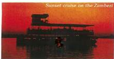
Sunset cruise on the Zambezi