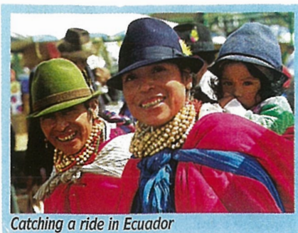
Catching a ride in Ecuador

The Galapagos Islands, located 600 miles off the coast of Ecuador, provide a natural habitat for some of the world's most unusual animals. This remarkable journey—customized by A.C.T. for maximum comfort—brings you face to face with the extraordinary natural wonders of this wildlife sanctuary. Encounter what Charles Darwin did—wildlife that does not fear people—and learn first hand from naturalist guides.